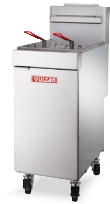
Model LG300 Shown with accessory casters