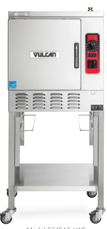
Model C24EA5-LWE Shown with optional stand