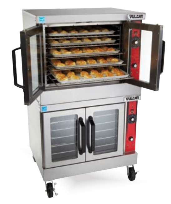
Model VC44GD Shown with optional casters