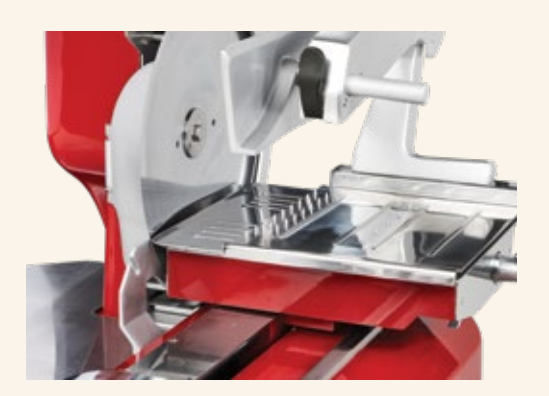
Model 330M - Carriage Tray detail