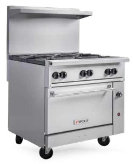
Model C36S-6BN Shown with optional casters