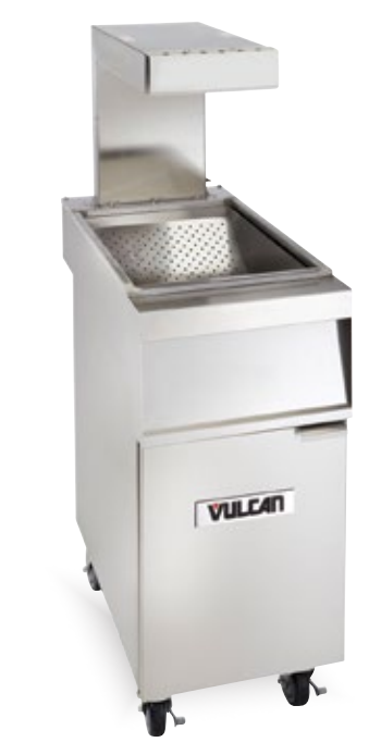
Model VX15 Shown with optional ThermoGlo™ Food Warmer