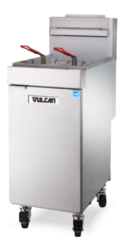
Model 1VEG35M Shown with accessory casters