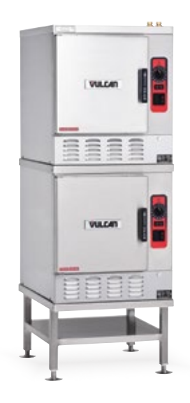
Two C24EA5 PS Steamers Shown with STCKKIT 24EA and STAND 15YSGL