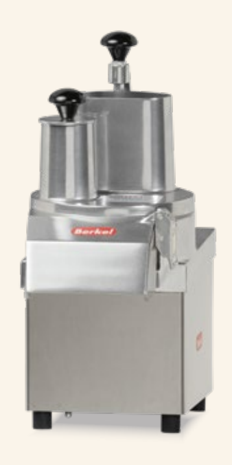
Model M2000 Additional Models Available