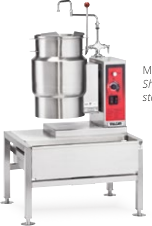
Model K6ETT Shown with optional stand and faucet