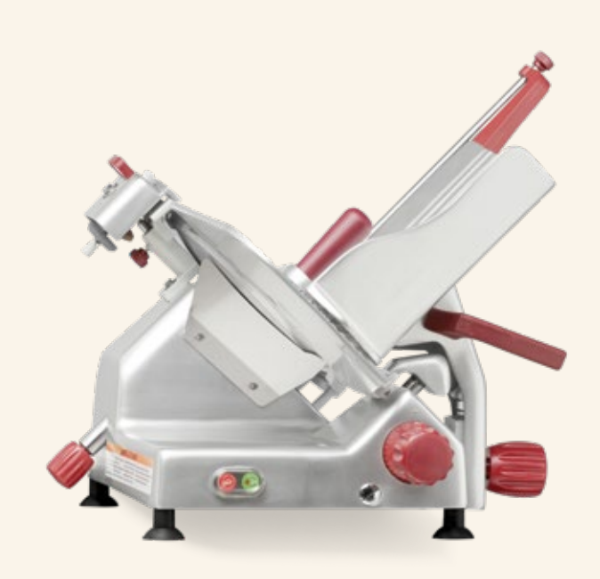
Model 827A-PLUS Additional Models Available