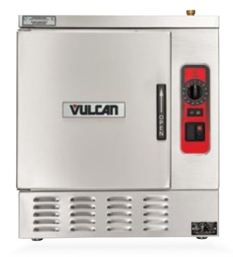
Model C24EA5 PLUS