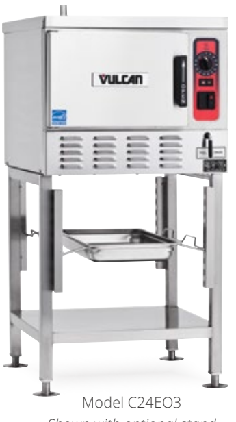
Shown with optional stand